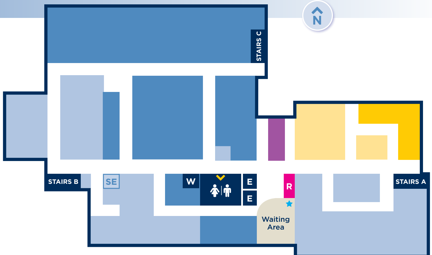
Stairs A, B and C (for emergency purposes only)