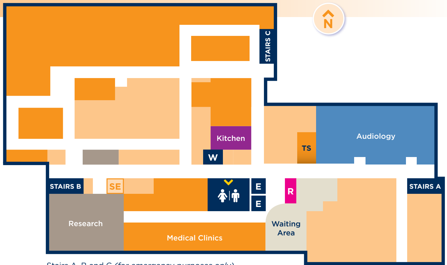
Stairs A, B and C (for emergency purposes only)