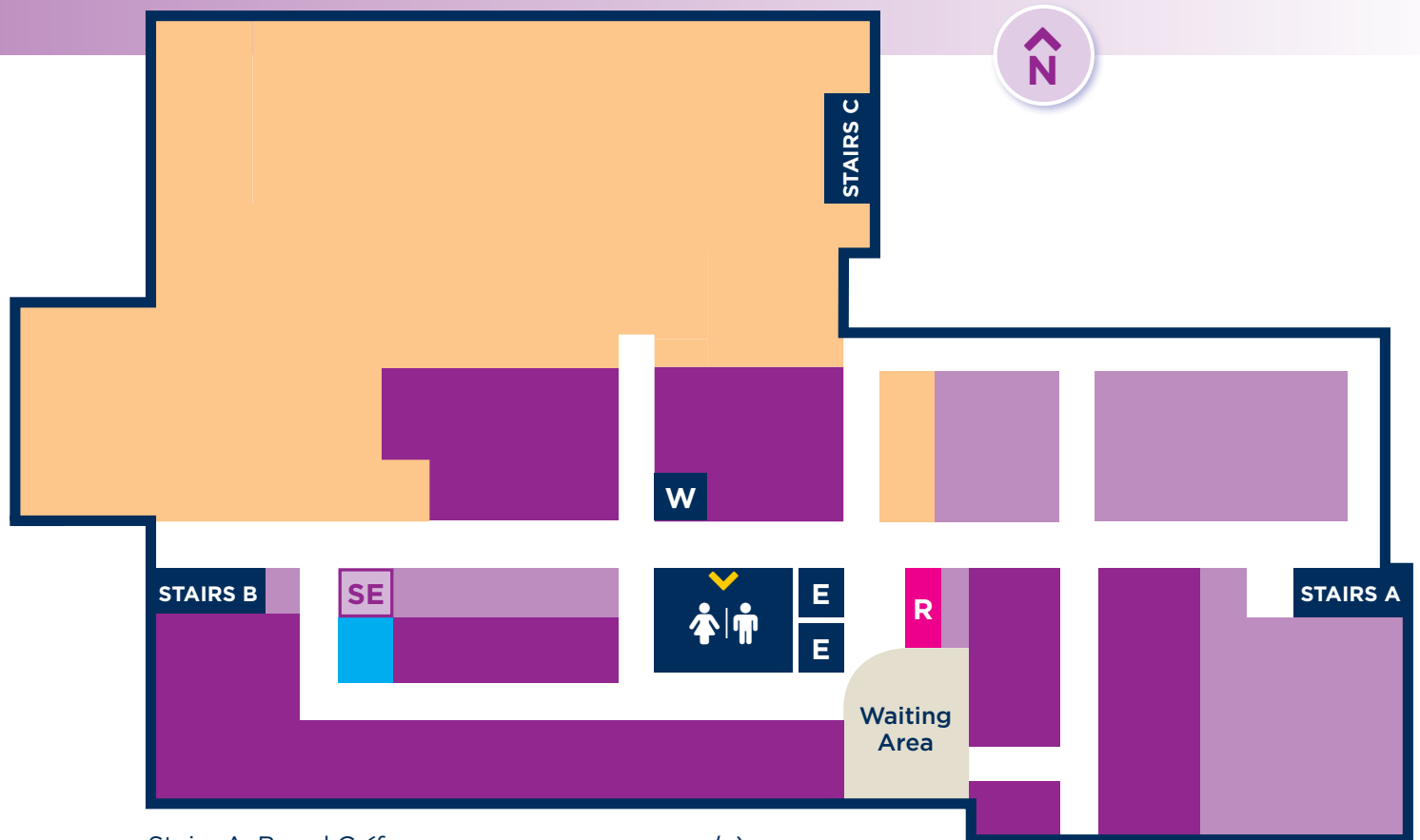
Stairs A, B and C (for emergency purposes only)